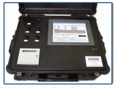
Optional - Portable Touch Screen Hardcase