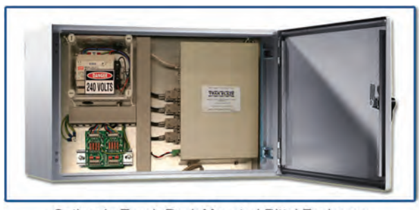
Optional - Tough Rack Mounted Rittal Enclosure

Whatever your workplace or challenging environment is, the FORCE 1 system and Trakblaze has the solutions to ensure your loads are weighed with unbeatable Speed and Accuracy. The FORCE 1 system SAVES time and MONEY by weighing on the go.