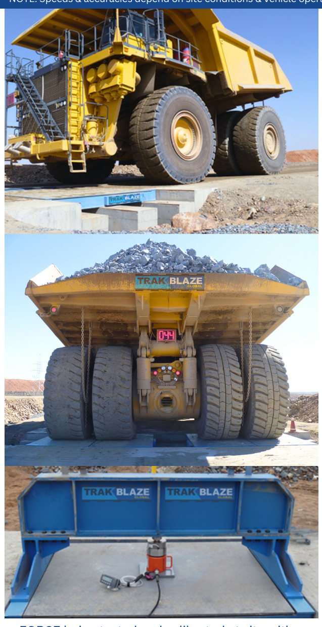
FORCE being tested and calibrated at site with a portable test press unit

Note: These are the same electronics & software used in our high speed 80 km/h govt. trade approved train weighing systems.