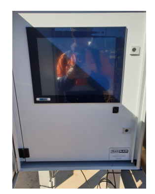
Weatherproof outdoor electrical cabinet

Note: These are the same electronics & software used in our high speed 80 km/h govt. trade approved train weighing systems.