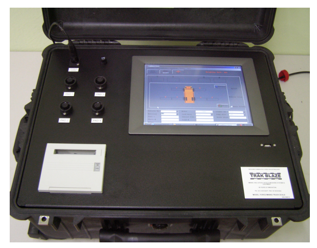
PC based controller with built-in printer in carry case Approx. dimensions 58cm x 45cm x 28cm

Features either a touch screen PC controller mounted in a weatherproof enclosure or a PC based rack system loaded with Trakblaze's proven and reliable user friendly software. The total truck weight is then derived from the summation of the individual wheel and axle loads and displayed on the PC interface.