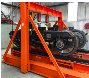
Bogie balancing press fitted with TRAKMATE loadcells