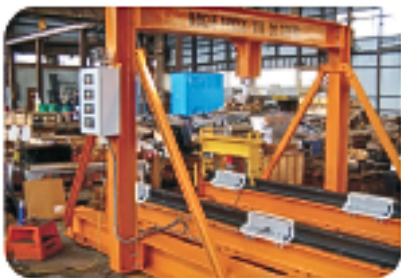
Bogie balancing press fitted with Trakmate loadcells