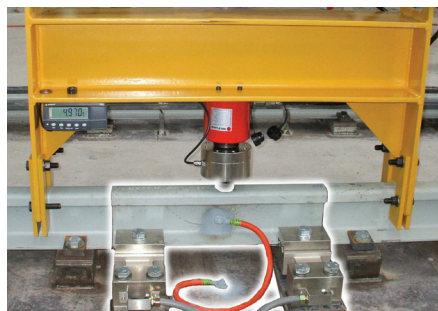
Trakmate test press is used for on-site calibration - no test train required