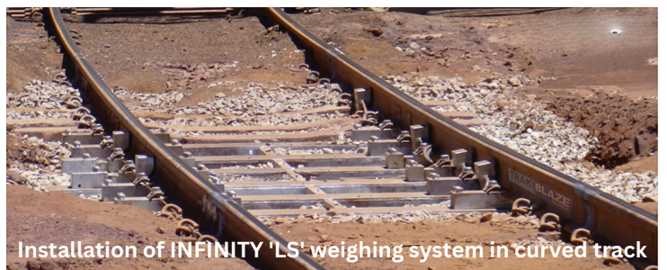
Installation of INFINITY 'LS' weighing system in curved track