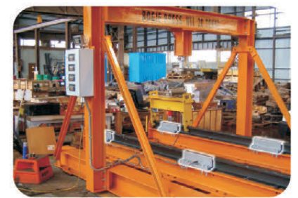
Bogie balancing press fitted with Trakmate loadcells