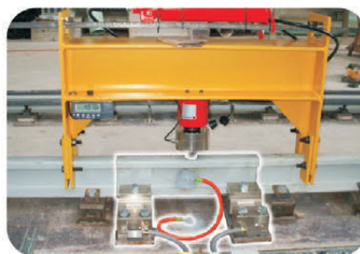
Trakmate test press is used for on-site calibration - no test train required